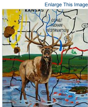
"Okesa" (2010), by Norman Akers.

on those islands; the sameness of the masks and their empty eyeholes suggest the way the Western gaze reduced such places to spoils of empire.