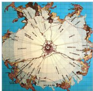
Courtesy of the artist and Hostfelt Gallery “South Pole” (2009), by Lordy Rodriguez.

For some of the show’s 38 artists, existing maps serve as raw material to be turned into sculptures, collages and such. For others, a map is the end result, created from experience or imagination to fix a place, a time or an idea. But all these objects, gathered by the guest curator, Sarah Tanguy, force you to reckon with maps as aids to meditation, objects of pleasure, blueprints for war, records of subjugation. And oh, yes, I almost forgot: as tools for getting from here to there and back again.